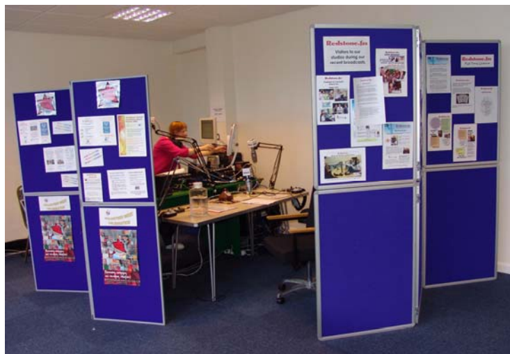
The temporary studio at Tower House (Belfry Centre)

This year we secured premises in Tower House, part of the Belfry Shopping Centre complex. We took possession a week before going on the air. Whilst coming on the air on the 27 May, the full weekday schedule started from Monday 1 June. This allowed time for technical issues to be ironed out before the first weekend.