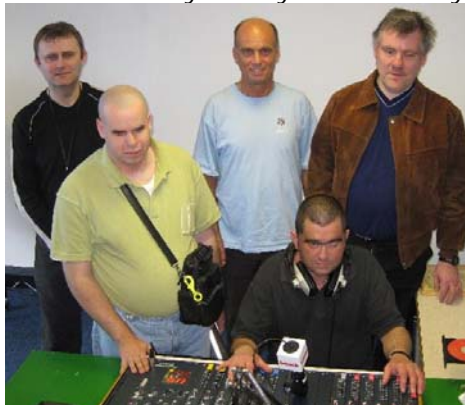
The students before their first shows live on air.

An unexpected bonus was the receipt of a grant from the ESF Community Grants Programme, administered by Surrey Community Action.